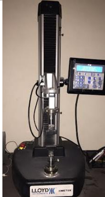
Illustration 1. Laboratory equipment