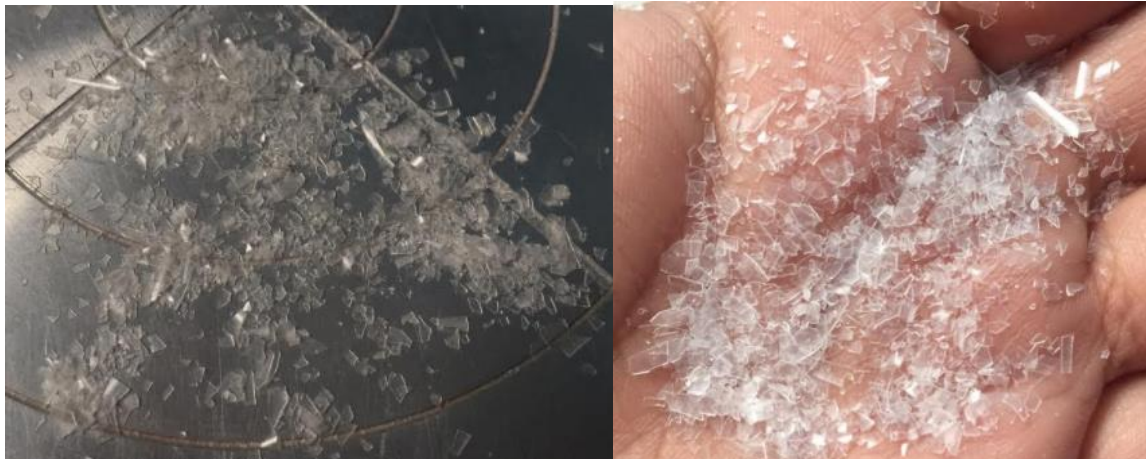
Illustration 3. Sample with 1% of additive after 242 hours