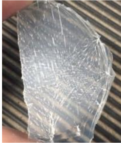
Illustration 2. Sample with 1% of additive after 218 hours